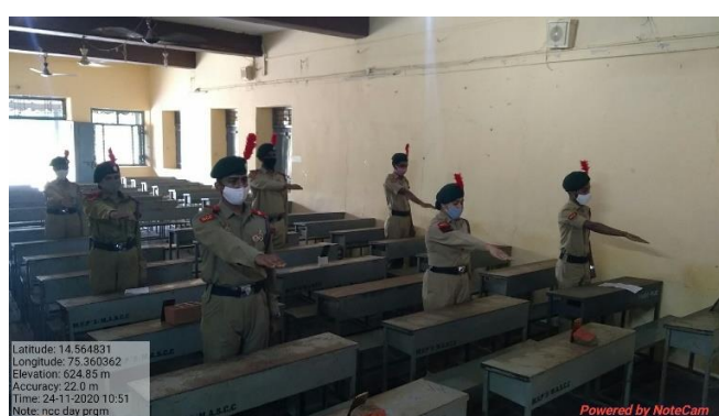
Oath taken by NCC Senior Cadets