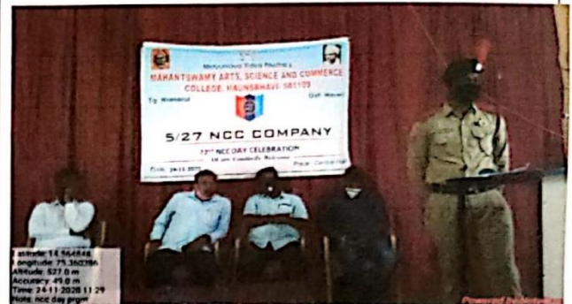
Vote of Thanks by- JUO. Jarish G.B

Number of NCC cadets attended offline: 10