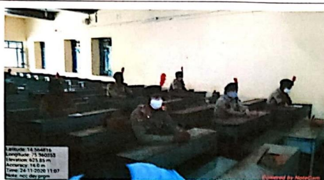
10 NCC Cadets attended with Covide Measures